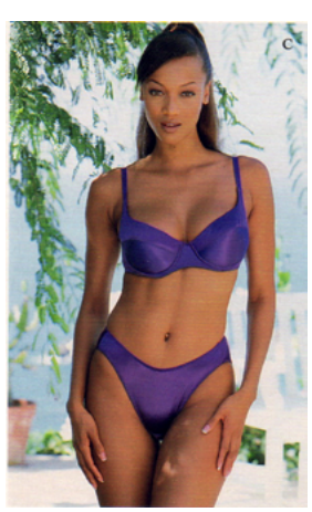
Figures 1 to 3 are from two pages in the Summer 1996 edition of Victoria's Secret catalogue, in which model Trya Banks depicts the woman as a passive object of the gaze.

These images were repeated in other catalogues throughout the year. The pattern continued so that in the "Fabulous Gifts" insert of the Christmas Specials 1998 catalogue, Tyra again adopts a reclining pose, with her legs crossed for modesty, which invokes pin-up photos. The only difference in the latter series is the setting, a satin covered bed.