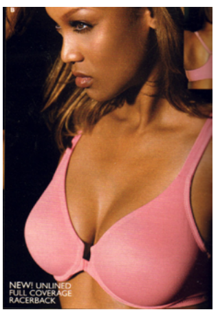
Figures 4 to 6 are from Victoria's Secret two-page spread in the Fall Fashion 2003 catalogue, in which model Tyra Banks's look and pose are adapted from the confrontational, "face-off" postures more commonly associated with masculinities.

In (first) analyzing this type of pose, Bordo (1999) assigns it to a masculine category, and perhaps with good reason. What becomes interesting is the gender assignment, masculinity, since such a move potentially reinscribes a binary gender system and limits potential modes of analysis even as it attempts to reconcile new poses with an (always) already dichotomous gender system. The distinction becomes important because the poses and postures have been adopted by contemporary models, photographers, and editors in compiling (at least) the Victoria's Secret catalogue. Instead of reconciling men as objects of the gaze, the style of representation attempts to justify hyperfemininity by posing it as female empowerment through the aggressive stances. In fact, the lingerie, like the clothes in the catalogues is far more revealing than those of the mid-1990s. This becomes