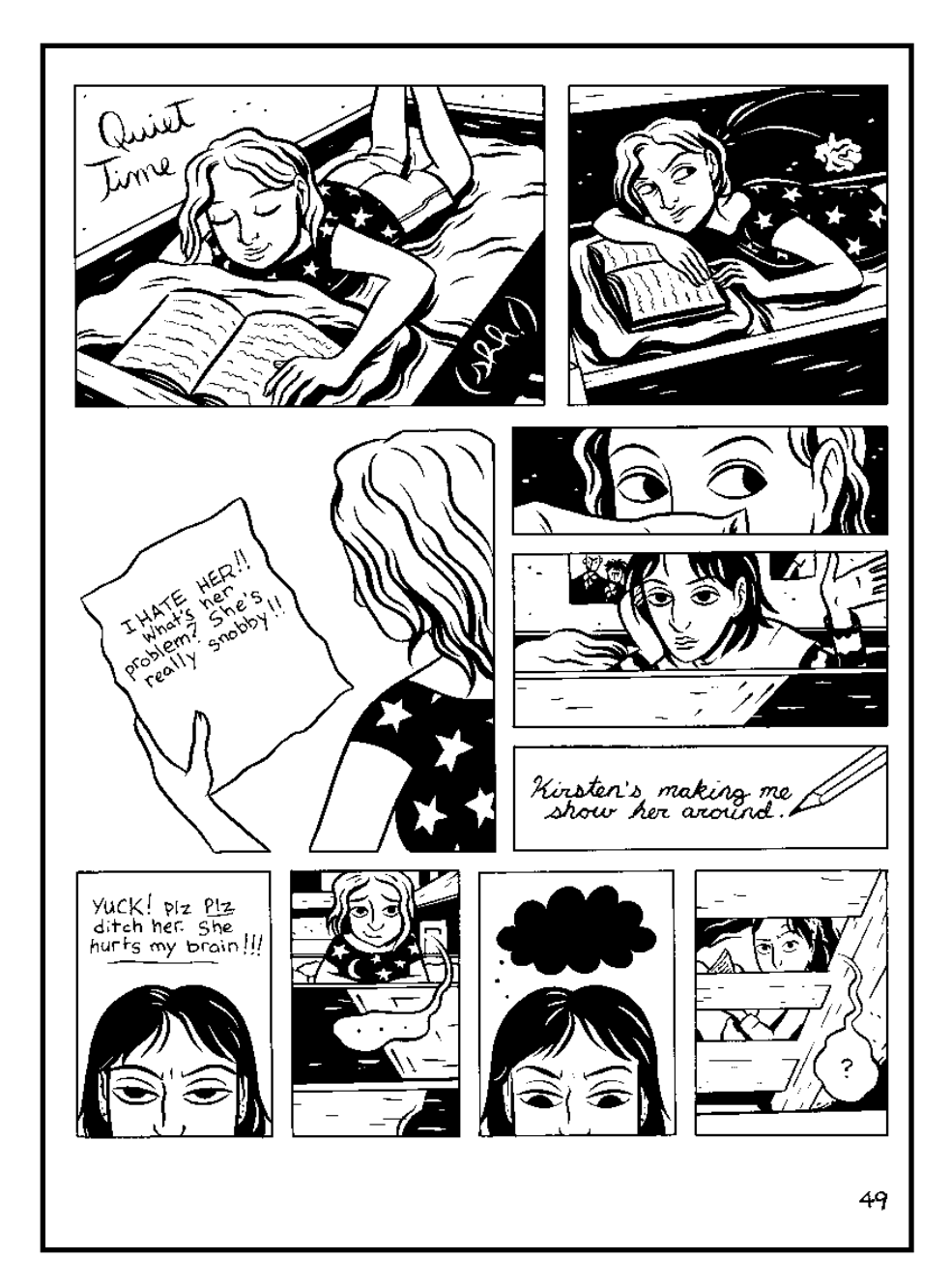
Figure 2. Page 49 of Chiggers. © Hope Larson. Courtesy of the artist.

"lessons" fit within the complex interpersonal exchanges and experiences of the female protagonist. Further, the graphic novel elegantly inserts notes and journal entries from the protagonist as part of the plot (Figure 2).